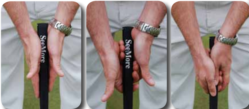
It Starts with a Great Grip

SeeMore's goal is for every golfer to possess a repeatable putting stroke that consistently performs at an elite level. We believe it is crucial to establish a solid foundation with natural, neutral angles that allow the golfer to make a tension-free putting stroke, with sound fundamentals, on each and every putt. SeeMore's RifleScope Technology (RST) trains the golfer to have a consistently square set up and the same posture for every single putt. In basketball, an elite player will always shoot their free throws the same way every time. Same routine. Same stance. Same posture. Great putting is no different. With the right grip, posture, stance (ball position), and alignment, the putting stroke becomes fluid, natural, and accurate, without thought. The golfer can focus on external factors such as speed control and the mental game necessary to make more putts. This is the SeeMore system.