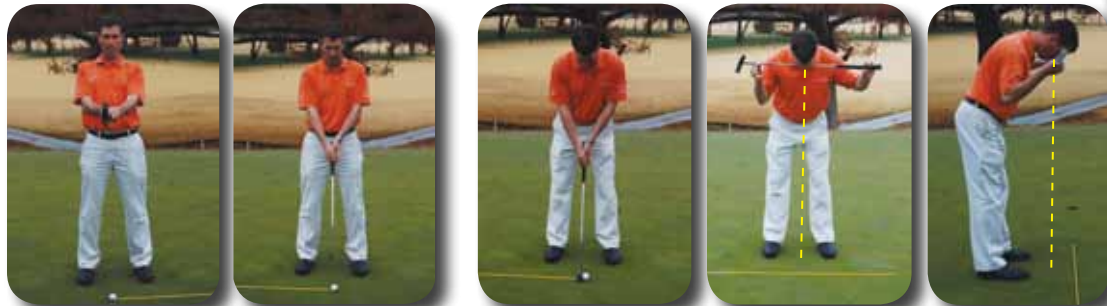
Consistent Ball Position, Neutral Angles = Perfect Alignment

A SeeMore Putter gives you a simple system to improve your alignment. When you address the ball and hide the red dot , you have confirmed that your eyes and shoulders have matching alignment. RifleScope technology eliminates the myth of eye dominance having an impact on putting. Optimum alignment is achieved as the weight is evenly balanced and the spine is level, with the nose directly over the sternum.