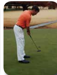
Natural Arc = Correct