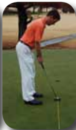
Eyes Over Ball = Incorrect