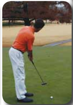
20 Foot Putt = Longer Back Swing