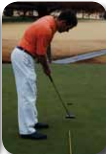
SBST = Manipulation = Incorrect