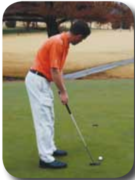
5 Foot Putt = Shorter Back Swing

When you achieve consistency of contact, you are now able to correctly develop your feel for distance control. By having a correct, neutral setup, the putter will swing as it was designed. Gravity will supply the power to the stroke, not forced acceleration. Essentially, only one variable remains - the length of the backswing will control the length of the putt. When the golfer does not have to worry about stroke related thoughts, the focus can be on creating a good picture and tapping into the instincts. This is the only true way to match speed and line.